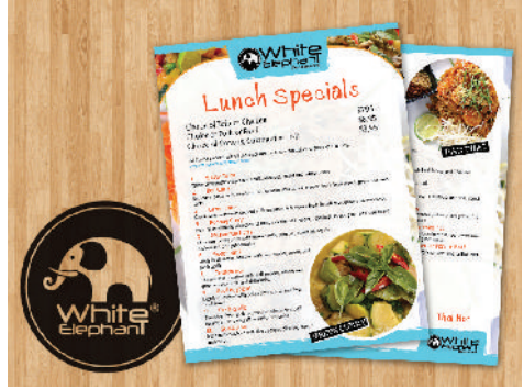
White Elephent (Thai Restaurant) : USA MENU DESIGN