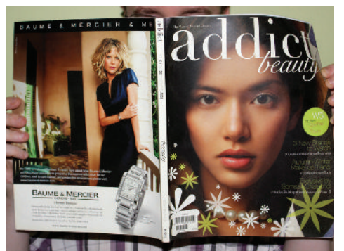
ADDICT Magazine : Thailand • MAGAZINE LAYOUT DESIGN ILLUSTRATION