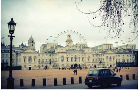
JOURNAL Photography • UK • HANOI, VIETNAM • THAILAND