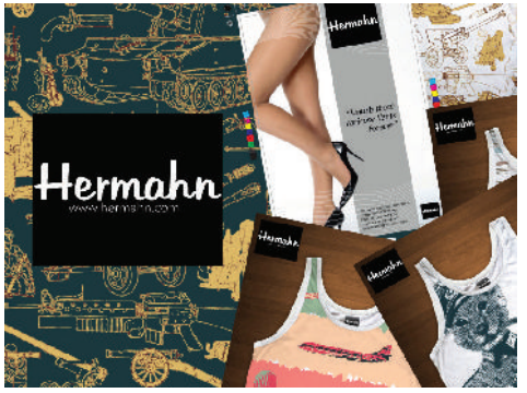
HERMAHN : Thailand LOGO DESIGNTANK TOP DESIGN PACKAGE COVER DESIGN

FAUVE Magazine : Bali • FASHION PHOTOGRAPHY