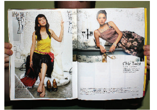
SUDSAPDA Magazine : Thailand • FASHION & EDITORIAL PHOTOGRAPHY