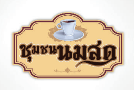
Chum Chon Nom Sod (coffee shop) : Thailand LOGO DESIGN MENU BOARD DESIGN